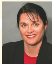
Affirming an Ethic of Care at the End of Life: Blending Quality with Compassion